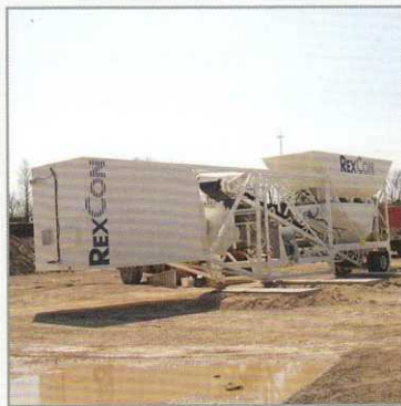
Single trailer transport