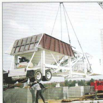
Portable or stationery installation