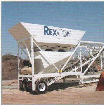
Hinged aggregate bin extensions