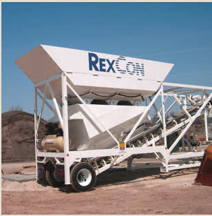
Hinged aggregate bin extension