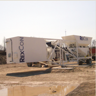
Single trailer transport