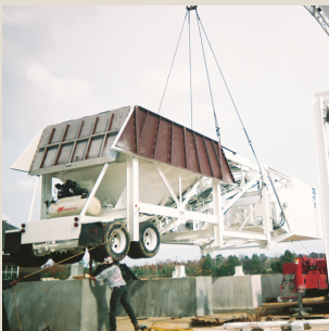
Portable or stationery installation